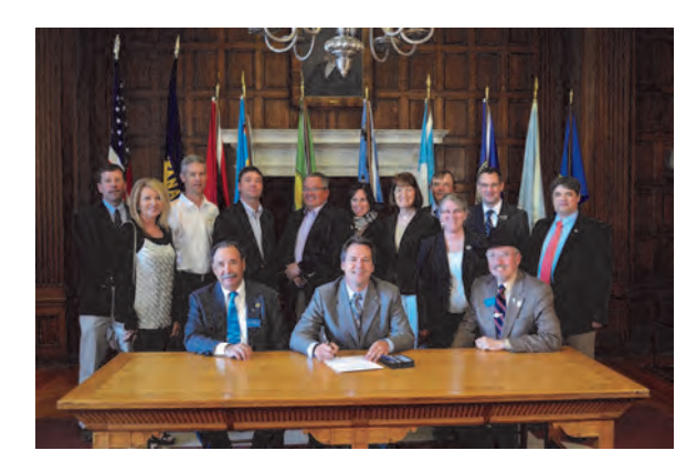
Gov. Bullock signs SB 261, the Sage Grouse Stewardship Act, into law.

SB 416 would have provided funding and authorization for capital and infrastructure projects statewide. It would have created a local infrastructure grant and loan account and program that would have been administered by the Montana Department of Commerce. It also would have established conditions for grants and loans for infrastructure projects and required local governments to provide matching funds based on a statutory formula. The proposal would have given priority to infrastructure projects that are related to the impacts from natural resource development. It would have been funded through the creation of state debt through the issuance of general obligation bonds and general fund transfers amounting to a total of $150 million. Because the bill contained bonding, it required a two-thirds vote of the House and Senate. While it passed in the Senate 47-3, it failed in the House 61-37. This vote is worth 5 points.