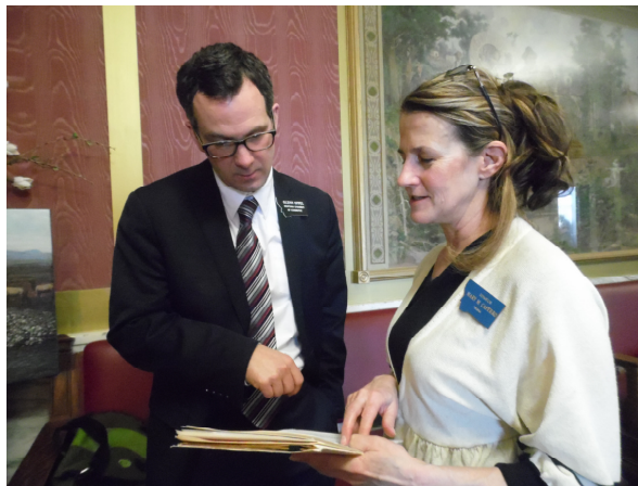
Glenn Oppel catches up with Sen. Mary Caferro (Helena) on health care legislation.

SB 173 would have moved the obligation for the $49 million Old Fund liability to current policyholders in the Montana State Fund (MSF) and negatively impacted MSF’s ability to pay dividends or potentially lower rates. SB 173 would have violated current law, which requires that any MSF monies to be used only for claims incurred after July 1, 1990. In sum, the bill would have negatively impacted current policyholders, which are most of Montana’s small businesses. SB 173 went to a free conference committee where funding to eliminate a large portion of the Old Fund liability was stripped out. The free conference committee report was rejected by the House (3-97) but adopted by the Senate (26-24), therefore the bill died in the process. These votes are utilized for this review and are worth 3 points.