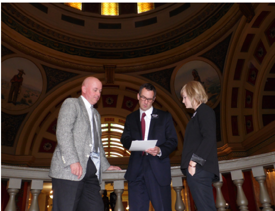
The lobbying team discusses strategy before a hearing on important legislation.

COMMITTEE VOTES: On committee votes, legislators sitting on those committees were given one point for each bill when the legislator supported the Chamber position. No points were awarded for votes against the Chamber position.