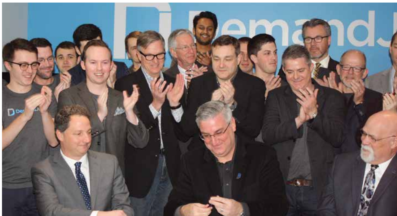
The Indiana Chamber saw the software-as-a-service clarification bill through from inception – the language originated in a Chamber policy committee – to conclusion with Gov. Eric Holcomb signing the measure into law.

NOTE: One policy we continue to actively engage on when needed – sales tax on services – was once again not even introduced in legislation. This is in part due to our dogged efforts explaining to those interested in this matter why it is bad for Indiana's tax climate. Sales tax on services would be very detrimental and harm our overall attractive tax structure.